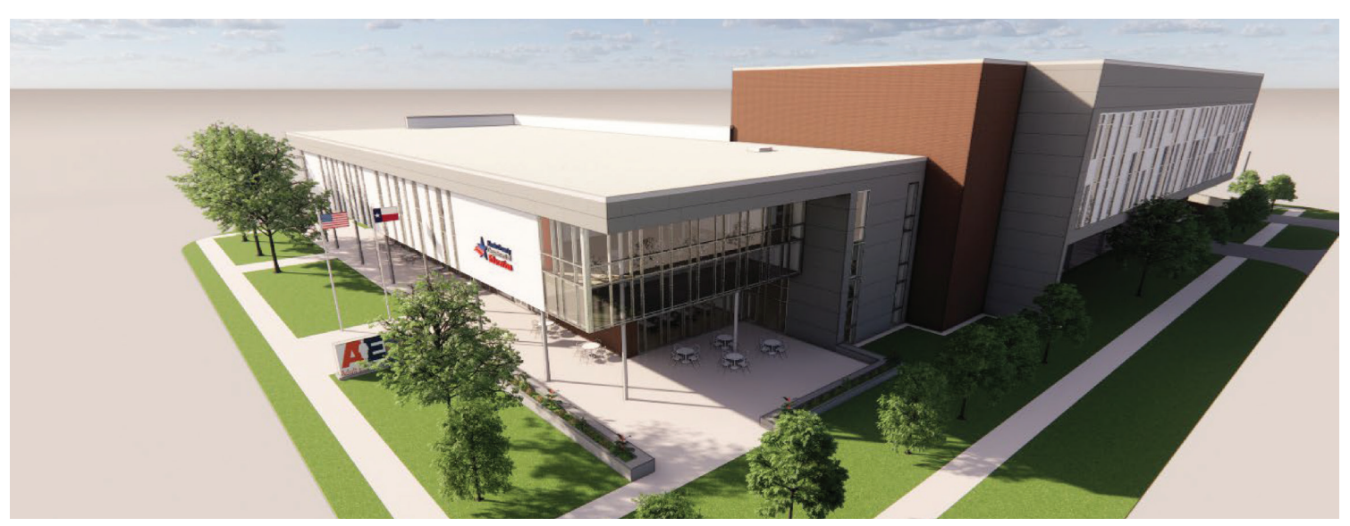
Adult Education Center