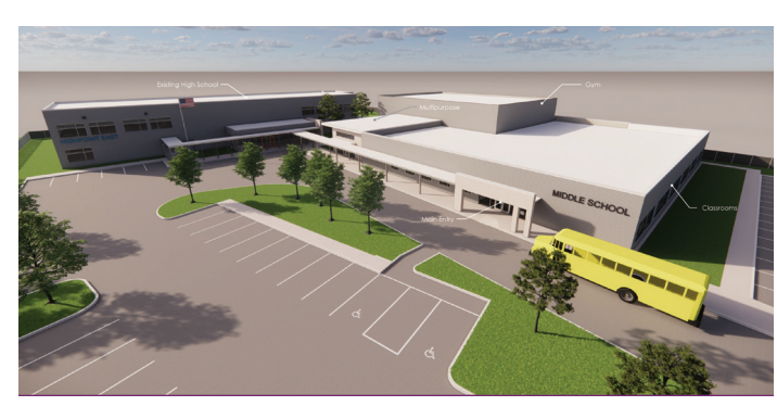
Highpoint Middle School

Construction on Highpoint MS and the new Adult Education Center is expected to begin during the last quarter of 2021.